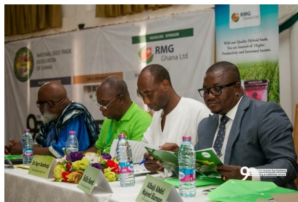
Some of the Dignitaries at the High Table