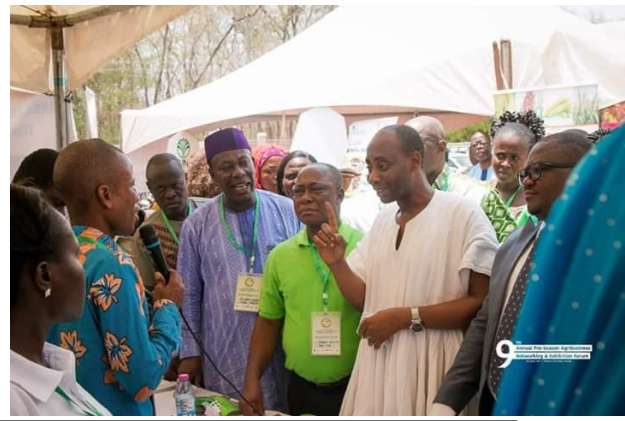
Hon. Deputy Minister, Food & Agriculture opening the Exhibition and interacting with Exhibitors